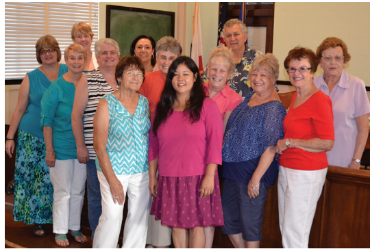
2015 Museum Associates