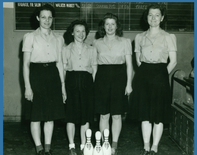
G.E. bowling team.

March is Woman’s History Month and in celebration of that our next Highlights from the Collection will focus on the women of Ontario. We will be discussing the women of General Electric and Hotpoint, different women’s clubs, and influential women of Ontario, such as former Councilwoman, one of the key people behind the creation of the Ontario Museum of History & Art, Faye Myers Dastrup-Hamill. Come learn more on March 20, 2015 at 2:00 PM in the former City Council Chambers named after Faye Myers Dastrup-Hamill, at the museum. Reservation required. For more information call (909) 395-2510.